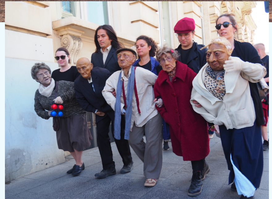
Rendez vous Chez Nous au Burkina Faso et au Mali 2021, Fête de l'Iris 2022