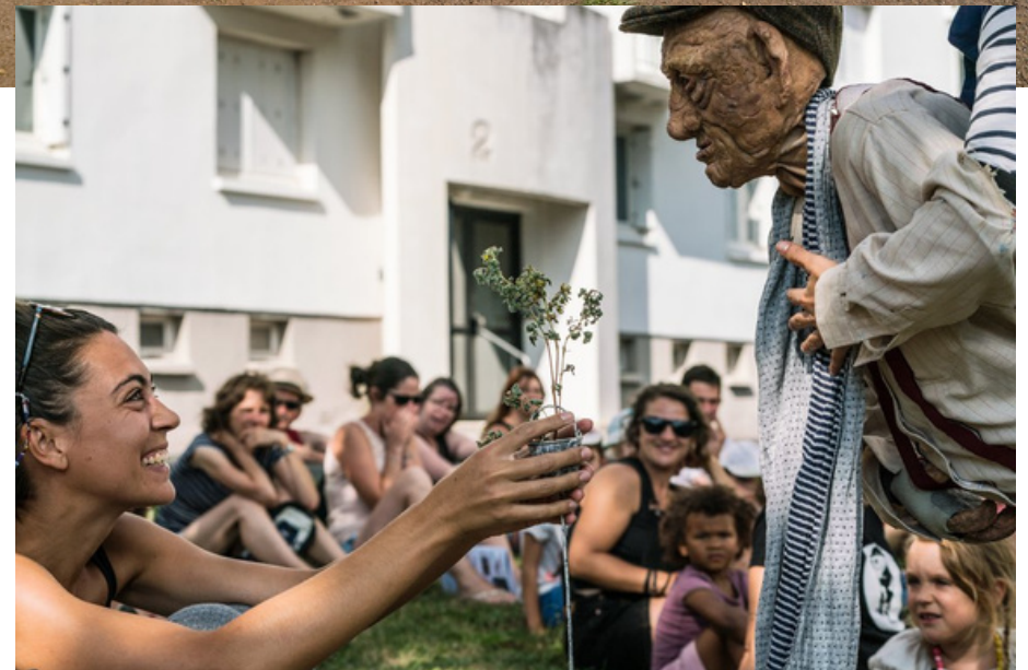
Quartiers Libres 2021 / MIMA 2019